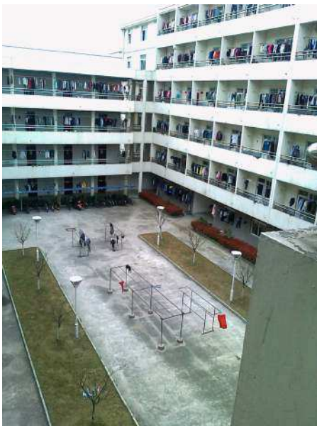
Dorm 9 at the Mingshuo factory, exterior view