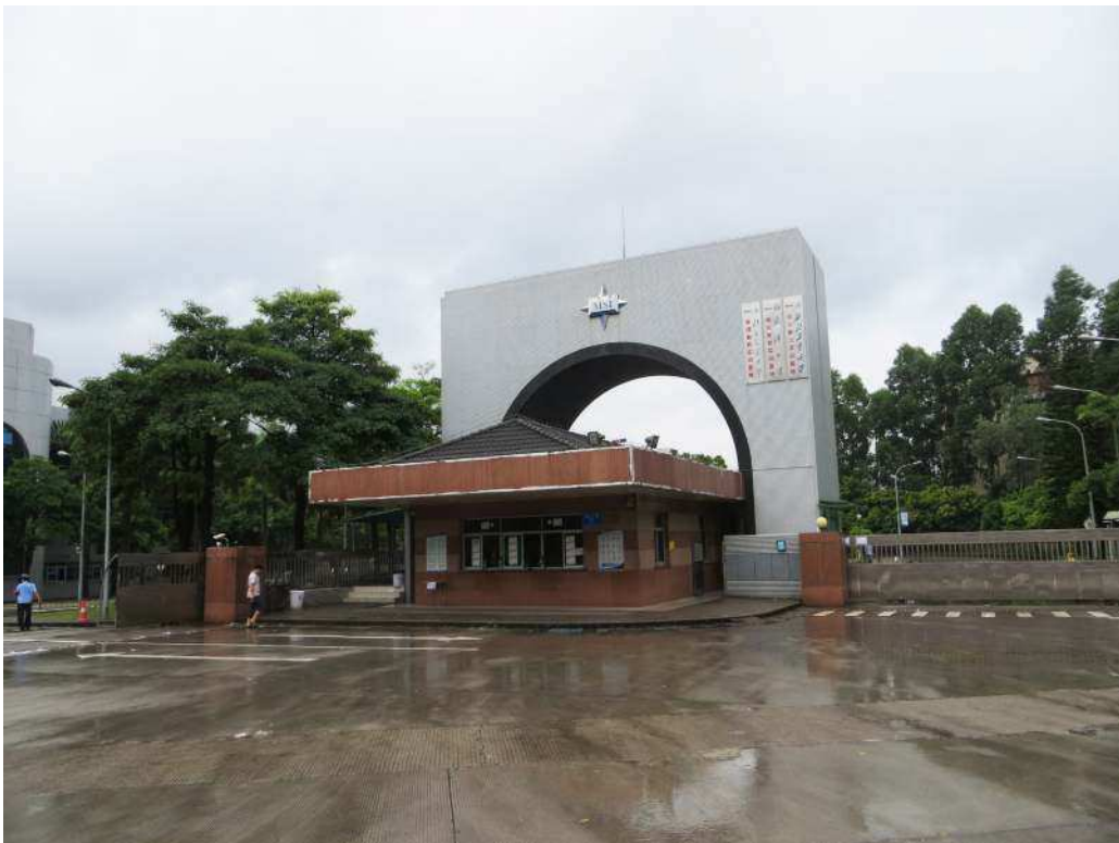
MSI factory, Shenzhen city