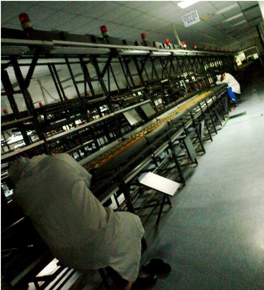
Workers on a short break during night shift

Tough working conditions and violations of a number of Chinese labour laws, international labour conventions and human rights were found when investigating the four Dell suppliers in the Guangdong and Jiangsu provinces 5 . Due to age limits applied by work agencies as well as in direct hiring by the factories, the workers are between 16 and 36, and often travel great distances in search of jobs. But once they start working in the factories and living in crowded dorms, few are satisfied with their situation. The majority of the workers interviewed outside the factory premises had specific plans of quitting within the next half year due to low wage, work pressure, long hours and no prospects of promotion 6 .