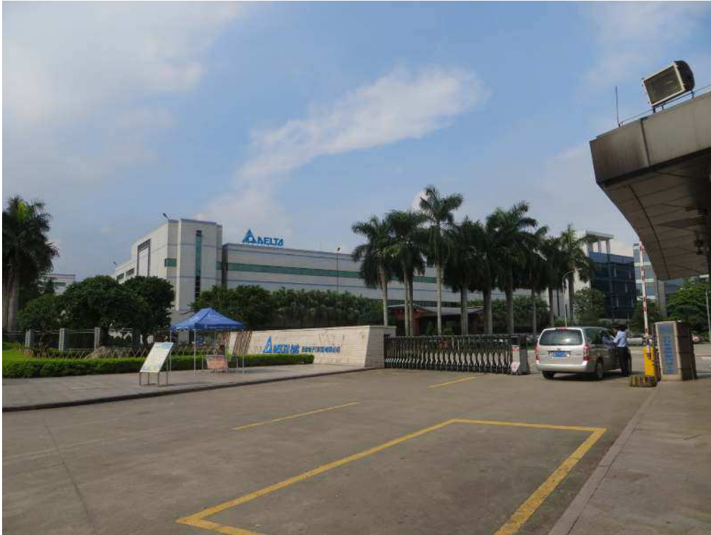
Taida Electronics factory, Dongguan city