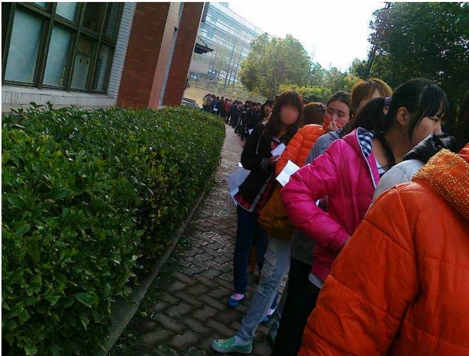
Recruitment line, Mingshou factory, Suzhou city

The American computer company Dell was founded in 1984 by Michael Dell. It is one of the largest technology-producing corporations in the world and a major player in the private and public PC market in Europe. Dell is the third largest PC vendor on the market worldwide 64 and the fourth on the European market 65 . Dell holds the top position in the worldwide PC monitor market 66 . The company opened its first plant in China in 1998 and has since expanded its presence in the country both in terms of production and sales. Dell has 25 exclusively owned subsidiaries in China 67 and an unknown number of secondary suppliers, and the company is now the largest provider of computers on the Chinese market 68 . Michael Dell stated in June 2013: "Our commitment to China has never been stronger, and this ongoing investment further demonstrates the importance of China to Dell's strategy and future." 69 With a recent expansion in the Chinese inland city of Chengdu, Dell appears to move away from the coastal areas to regions with lower minimum wage-levels 70 .