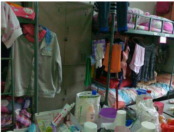
Dorm 9 at the Mingshuo factory, interior view

55 workers have to share one toilet and 27 workers have to share one shower, creating long queues. 272 workers have to share one coin operated washing machine. Sometimes there are water shortages and no hot water. At the MSI factory, 10 workers share a 30 square meter room, sharing one small and dirty toilet; the shower is shared with other rooms. The poor and cramped conditions leave the inhabitants with little privacy, and necessities like washing and drying clothes, personal hygiene and the like are made complicated and time-consuming 45 .